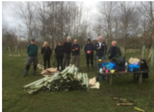
Greendale Wood 29th March 18