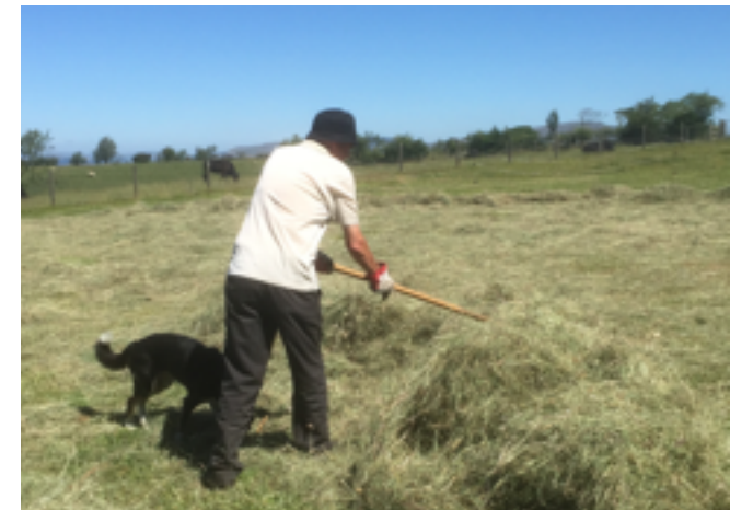
Raking up for hand baling Tatham 30th June 2018