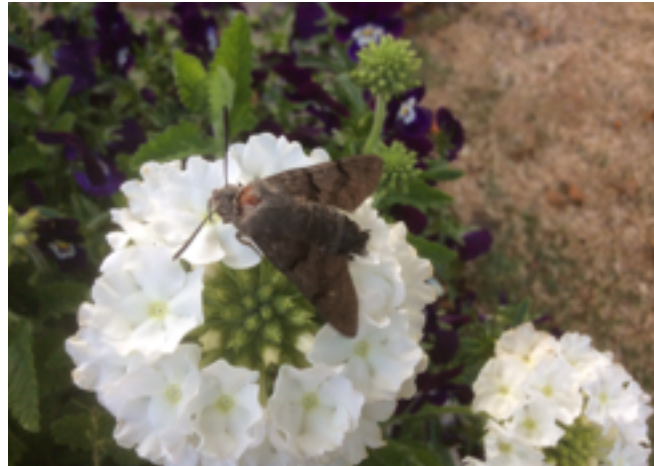
Hummingbird hawkmoth 14th July 2018