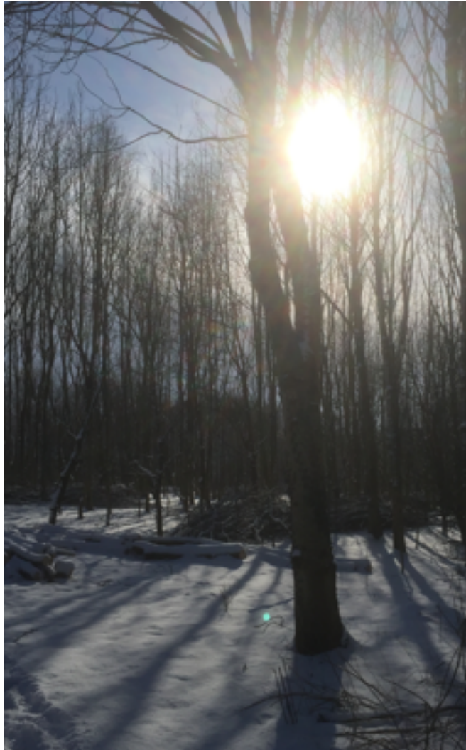
Greendale Wood 28th Feb 2018